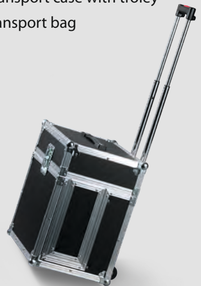
Trolley for comfortable and safe transport