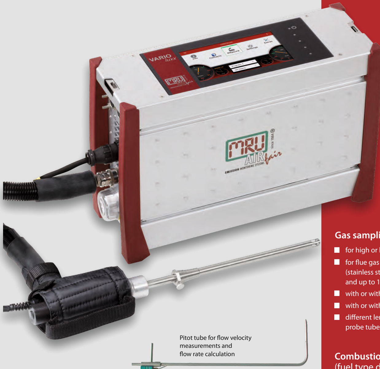
Pitot tube for flow velocity measurements and flow rate calculation