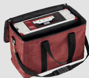
Useful nylon protection case with shoulder strap